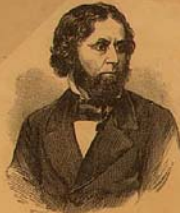
JOHN C. FREMONT.